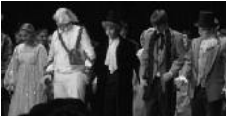
The cast of A Christmas Carol take their final bow.