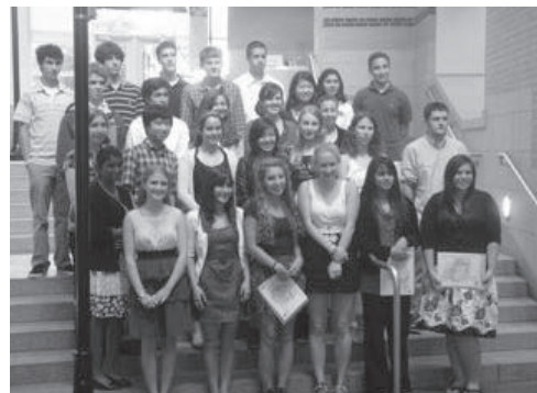
Discover the Cure Interns at Yale University Summer Program