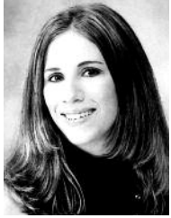
Epoch Photo '04

This year we welcome two alumnae to the faculty and staff at Mercy. One called Mercy her second home a few years ago; the other is from the 10th graduating class of Mercy High.