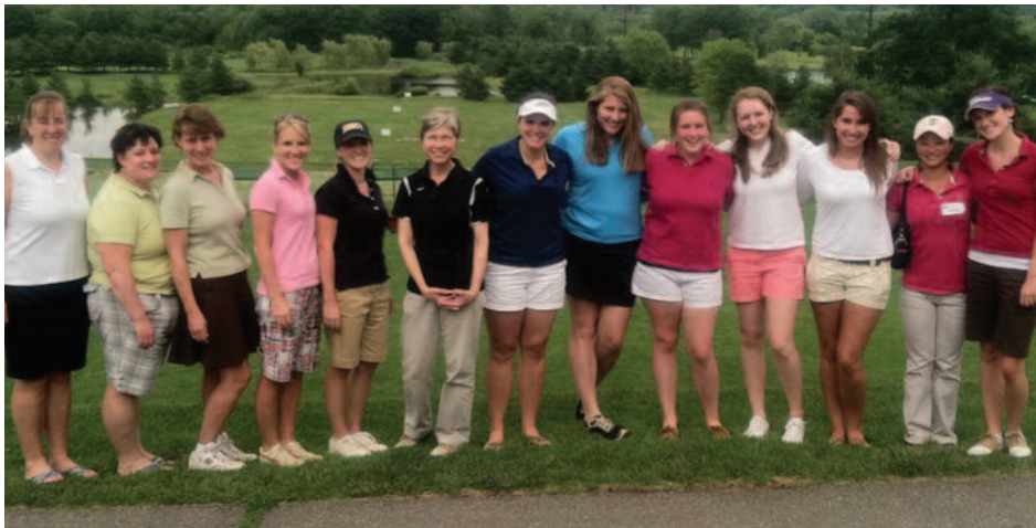
Mercy alumnae representing classes from 2009 to 1967 participated in the Mercy Golf Classic.

The 19th Annual Mercy Classic Golf Tournament, to benefit the Mercy High School Scholarship Fund, was held at Lyman Orhards Golf Course on Monday, June 13. The rain held off for the mix of alumnae, parents, parents of alumnae and friends to enjoy a good day of golf and camaraderie. Alumnae from the Class of 2009 won the Women's Division for the second year in a row.