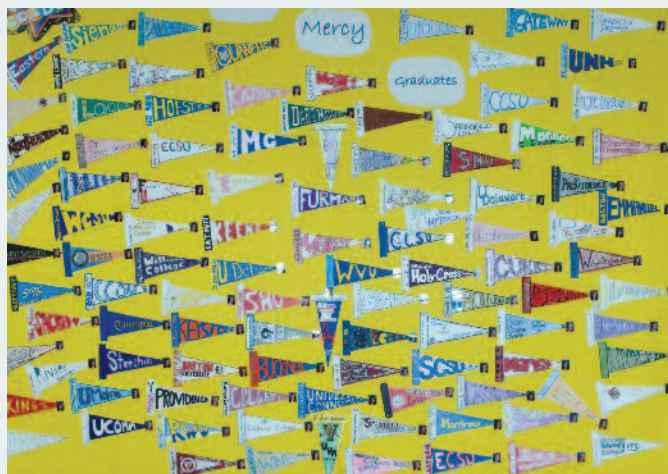
A bulletin board outside the cafe proudly announces the future plans of our Class of 2011.

Class Night was a memorable evening. They laughed and cried together as a class for one last time before graduating.